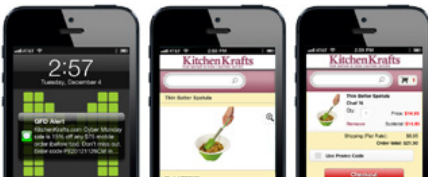
mShopper SMS Campaign: Send your alert, user clicks, user buys!

Your new mStore also includes a fully integrated SMS marketing solution. Speak to your most valuable shoppers wherever they are, whenever you want. (A value of up to $1000 per month, for free.)